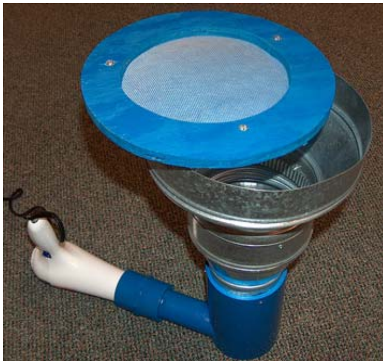
Figure 1. Assembled vortex dryer with lid removed

The vortex dryer can be built for approximately $40 and is as accurate as a drying oven. Most hay samples can be dried in 15 to 20 minutes; most silage samples will dry in 40 to 60 minutes, depending on crop characteristics.