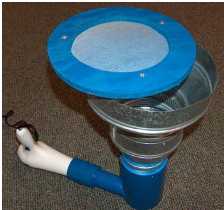
Figure 1. Assembled vortex dryer with lid removed

The vortex dryer can be built for approximately $40 and is as accurate as a drying oven. Most hay samples can be dried in 15 to 20 minutes; most silage samples will dry in 40 to 60 minutes, depending on crop characteristics.