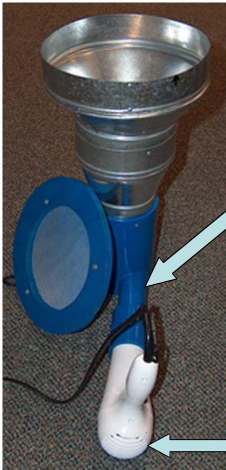
Figure 2. Assembled vortex dryer

Accuracy of the vortex dryer was determined by comparing results from 200 gram (7.06 ounce) sub-samples of 12 different forages dried in a vortex dryer and a drying oven. Four replicates of each sub-sample were dried using each method. The vortex dryer average error was -0.1%. Moisture estimates were within 1% of the actual value 95% of the time. There was no statistical difference between the vortex estimates and the drying oven estimates. Just because the method is accurate, however, does not mean the estimate from a sample is accurate. Proper sampling is critical – particularly when there is variability within a field, from field to field, from load to load, across a bunker face, etc. The vortex device and the associated method allows for replicate sample drying in a relatively short period of time. With approximately the same time, effort, and cost, a person could dry three 200 gram forage samples in three vortex dryers rather than three 100 gram samples in a microwave oven; there would be no risk of burning the samples and the larger vortex dryer samples reduce sampling error.