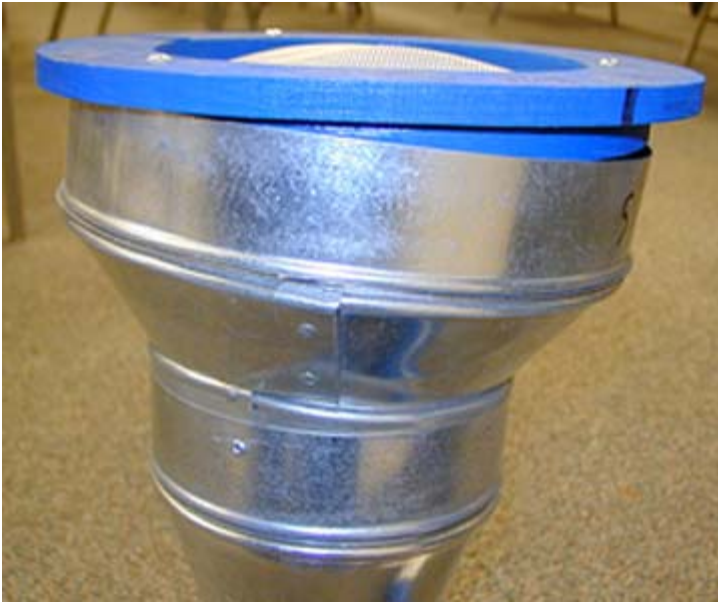
Figure 5. Vortex dryer lid snugly fitting into the drying chamber.