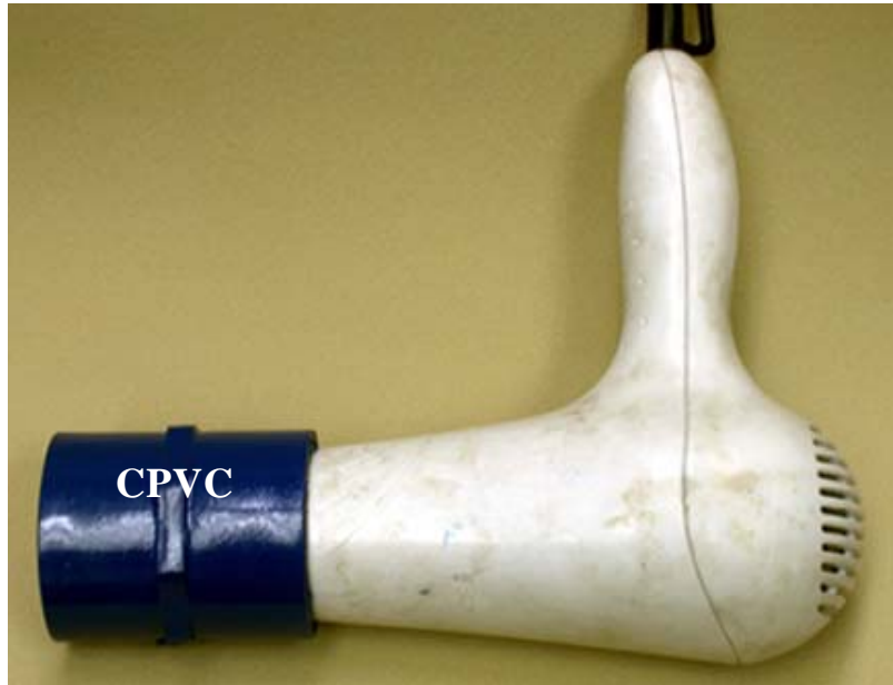
Figure 6. Blow dryer glued to the coupler which would slide onto the air entrance tube (unglued).

For a complete listing of Agricultural and Biological Engineering fact sheets, visit http://www.age.psu.edu/extension/informationindex.html