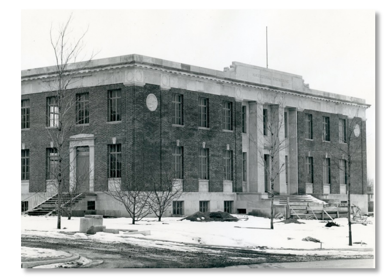
Figure 8. 1937 Agricultural Engineering Building.

4. What is your total budget for research and instruction?